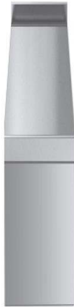
588560 (MBNABBAOOO) Closed Work Top, one-side operated with backsplash